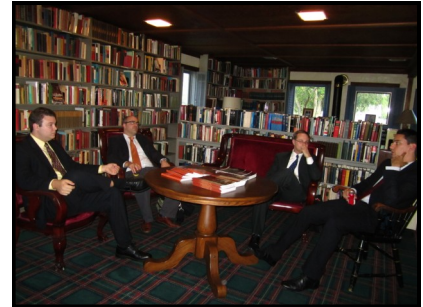
"Joseph Story and the Stewardship of American Constitutionalism" Sponsored by ISI and Liberty Fund