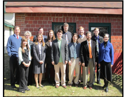
"Orestes Brownson, and Alex de Tocqueville" seminar for students from Aquinas College, Grand Rapids, MI