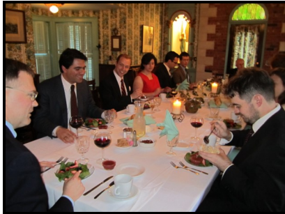
Luncheon at Piety Hill "The Scottish Enlightenment" Sponsored by ISI and Liberty Fund